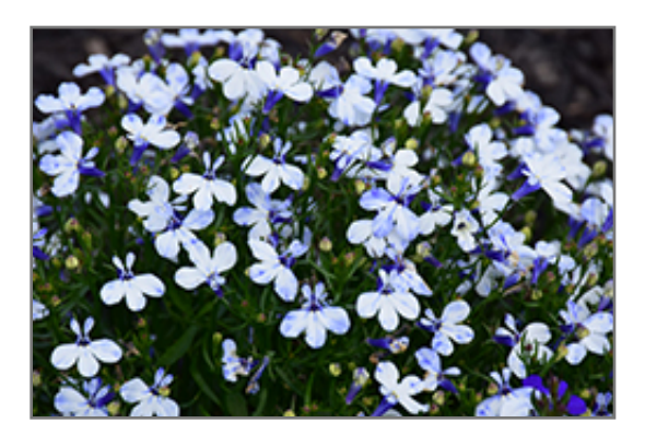
Techno Upright Delft Blue Lobelia flowers