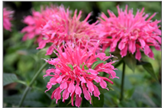
Coral Reef Beebalm flowers

Coral Reef Beebalm is recommended for the following landscape applications;