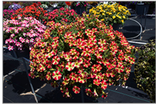
Amore Queen of Hearts Petunia in bloom

Amore Queen of Hearts Petunia will grow to be about 12 inches tall at maturity, with a spread of 14 inches. When grown in masses or used as a bedding plant, individual plants should be spaced approximately 10 inches apart. Its foliage tends to remain dense right to the ground, not requiring facer plants in front. This fast-growing annual will normally live for one full growing season, needing replacement the following year.