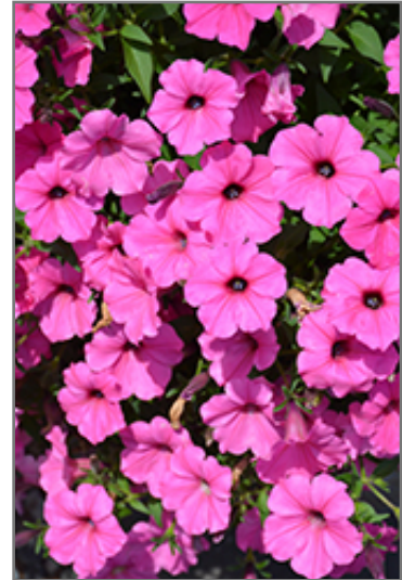
ColorRush Pink Petunia flowers

ColorRush Pink Petunia is recommended for the following landscape applications;