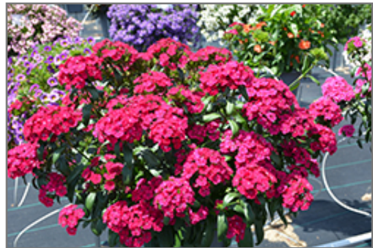
Jolt Cherry Hybrid Pinks in bloom