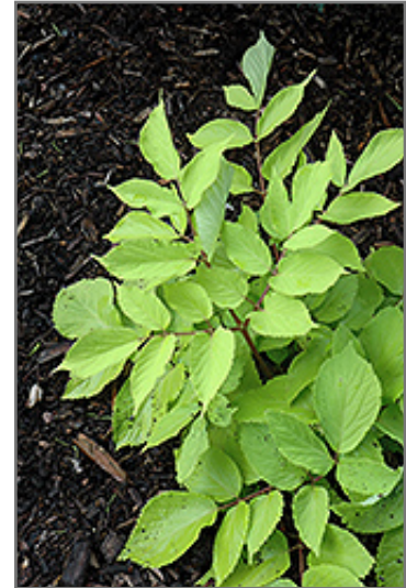
Sun King Japanese Spikenard foliage

This plant performs well in both full sun and full shade. It prefers to grow in average to moist conditions, and shouldn't be allowed to dry out. It is not particular as to soil type or pH. It is highly tolerant of urban pollution and will even thrive in inner city environments. This is a selected variety of a species not originally from North America.