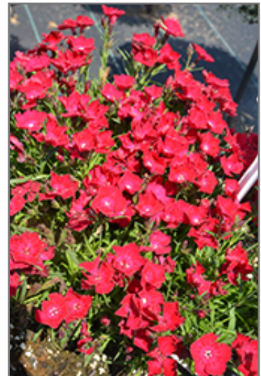
Beauties Tyra Pinks flowers