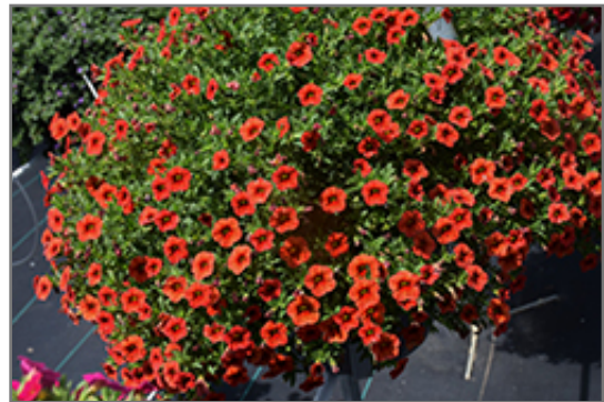
Cha-Cha Orange Calibrachoa in bloom