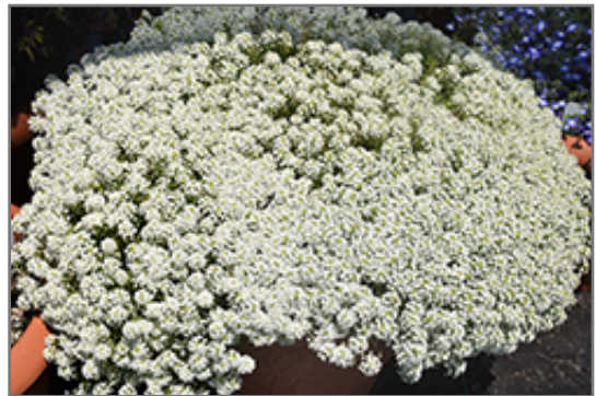
Snow Globe Alyssum in bloom