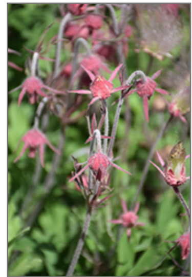
Prairie Smoke flower buds