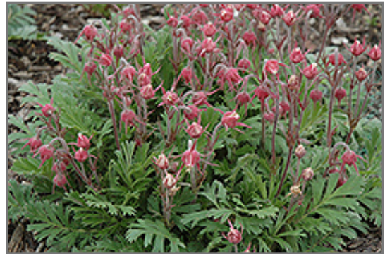
Prairie Smoke in bloom

This plant will require occasional maintenance and upkeep, and should be cut back in late fall in preparation for winter. It is a good choice for attracting butterflies to your yard, but is not particularly attractive to deer who tend to leave it alone in favor of tastier treats. Gardeners should be aware of the following characteristic(s) that may warrant special consideration;