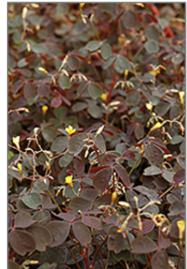
Burgundy Bliss Shamrock flowers