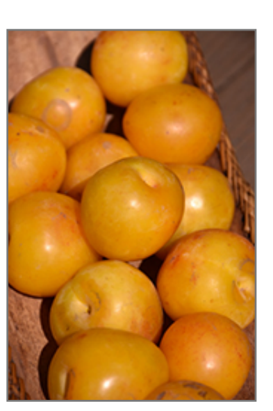
Brookgold Plum fruit