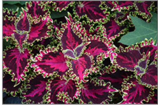
Volcanica Solar Flare Coleus foliage

Volcanica Solar Flare Coleus is recommended for the following landscape applications;