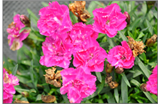
Beauties Melinda Pinks flowers

Beauties Melinda Pinks is recommended for the following landscape applications;