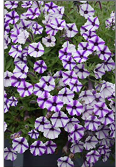
Supertunia Mini Vista Violet Star Petunia flowers

Supertunia Mini Vista Violet Star Petunia is a dense herbaceous annual with a trailing habit of growth, eventually spilling over the edges of hanging baskets and containers. Its medium texture blends into the garden, but can always be balanced by a couple of finer or coarser plants for an effective composition.