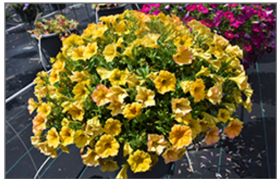
SuperCal Premium Yellow Sun Petchoa in bloom