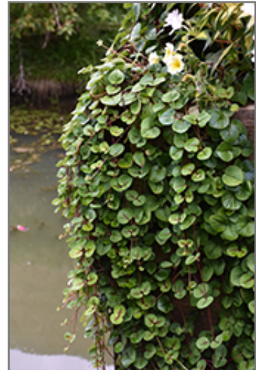
HILLIER Sunburst Moneywort