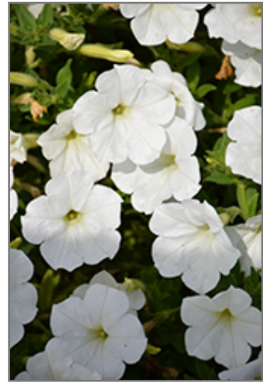
ColorRush White Petunia flowers