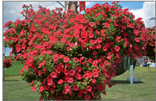
ColorRush Watermelon Red Petunia in bloom

ColorRush Watermelon Red Petunia will grow to be about 12 inches tall at maturity, with a spread of 30 inches. When grown in masses or used as a bedding plant, individual plants should be spaced approximately 24 inches apart. Its foliage tends to remain dense right to the ground, not requiring facer plants in front. This fast-growing annual will normally live for one full growing season, needing replacement the following year.