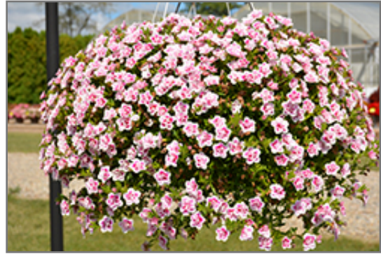
MiniFamous Uno Double PinkTastic Calibrachoa in bloom