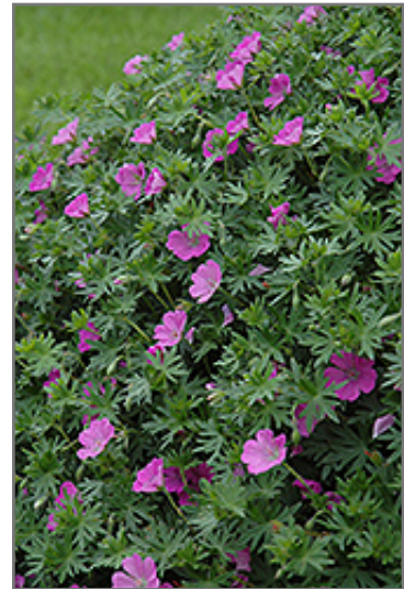
Bloody Cranesbill flowers