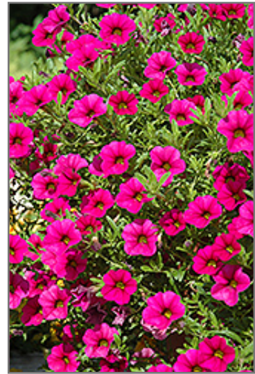
Cabaret Rose Calibrachoa flowers