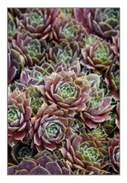
Purple Beauty Hens And Chicks