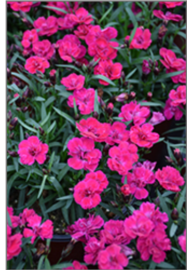
Beauties Tiiu Pinks flowers

Beauties Tiiu Pinks is recommended for the following landscape applications;