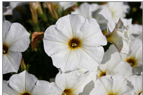
SuperCal Premium Pearl White Petchoa flowers