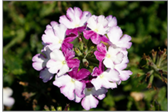
Firehouse Purple Fizz Verbena flowers

Firehouse Purple Fizz Verbena is recommended for the following landscape applications;