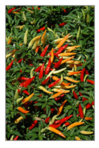
Basket Of Fire Ornamental Pepper fruit

This plant will require occasional maintenance and upkeep, and should not require much pruning, except when necessary, such as to remove dieback. Deer don't particularly care for this plant and will usually leave it alone in favor of tastier treats. It has no significant negative characteristics.