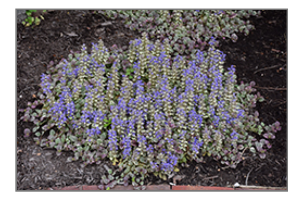
Burgundy Glow Bugleweed in bloom

Burgundy Glow Bugleweed is a fine choice for the garden, but it is also a good selection for planting in outdoor containers and hanging baskets. Because of its spreading habit of growth, it is ideally suited for use as a 'spiller' in the 'spiller-thriller-filler' container combination; plant it near the edges where it can spill gracefully over the pot. Note that when growing plants in outdoor containers and baskets, they may require more frequent waterings than they would in the yard or garden. Be aware that in our climate, most plants cannot be expected to survive the winter if left in containers outdoors, and this plant is no exception. Contact our experts for more information on how to protect it over the winter months.