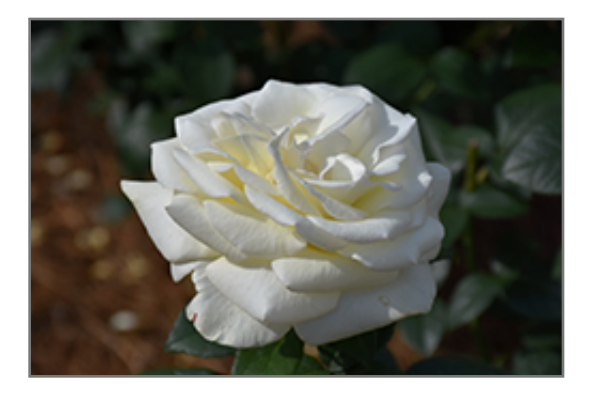
Sugar Moon Rose flowers

Sugar Moon Rose is recommended for the following landscape applications;