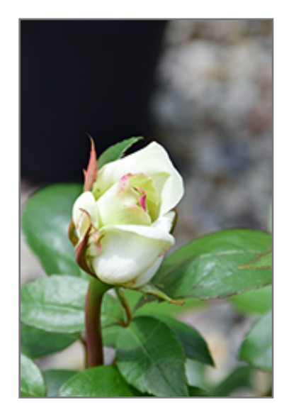
Sugar Moon Rose flower buds

This plant is not reliably hardy in our region, and certain restrictions may apply; contact the store for more information.