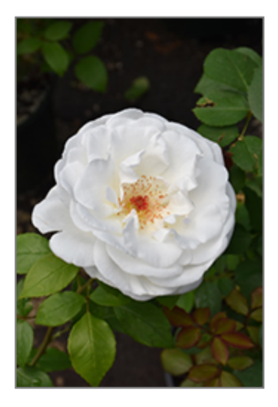
Sugar Moon Rose flowers

(t) 403-223-1049 (w) www.sunnysidenursery.ca (e) hello@sunnysidenursery.ca