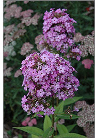
Jeana Garden Phlox flowers

Jeana Garden Phlox is recommended for the following landscape applications;