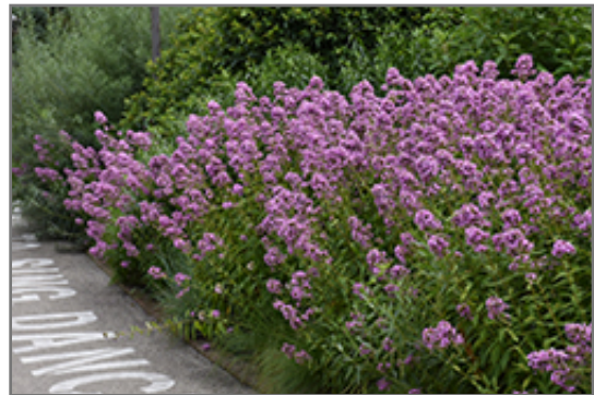
Jeana Garden Phlox in bloom