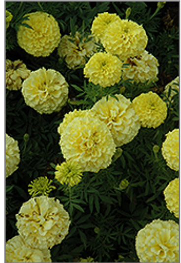
Lady Primrose Marigold flowers