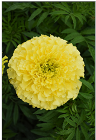
Lady Primrose Marigold flowers