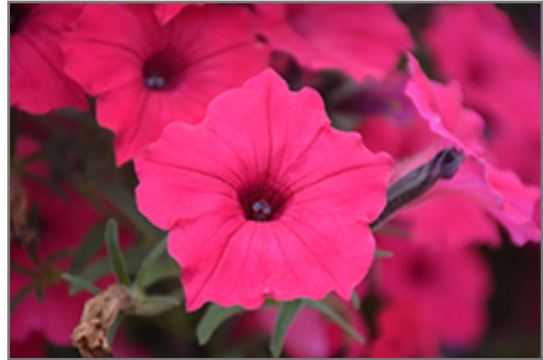
Supertunia Vista Fuchsia Petunia flowers