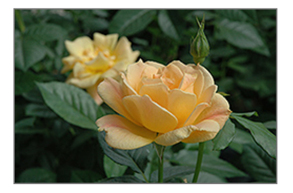
Easy Going Rose flowers